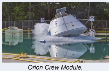
Orion Crew Module.

NASA has been preparing to go back to deep space with the development of the Orion Crew Module, which has gone through changes since the Constellation Program was cancelled. The Orion Crew Module was essentially retained from that program and STC has continued to support various projects associated with Orion. STC has built or been a part of three crew module flight test articles, which have included ARES-1X, Pad Abort 1, and Max Launch Abort System (MLAS). But what goes up must come down and work has been ongoing with drop tests at Langley Research Center (LaRC) in preparation for water landings. STC was instrumental in the fabrication of the Boilerplate Test Article (BTA) (pictured above), which has gone through a series of water impact tests at the Langley Hydro Impact Basin. Since that series of tests, the Lockheed Martin-built Ground Test Article (GTA) has been delivered to LaRC to prepare it for its own series of water impact tests. Lockheed Martin is the prime contractor for the crew modules that NASA will be flying. STC has supported modifications to the GTA and participated in critical lifts to mate and de-mate the GTA with the heatshield. STC has been supporting this effort, led by Mr. Eric May . Eric and