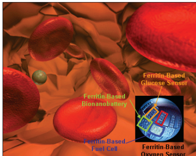
Autonomous bio-power/bio-sensors health monitoring system embedded inside blood vessel.